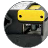
Sealable plastic cover